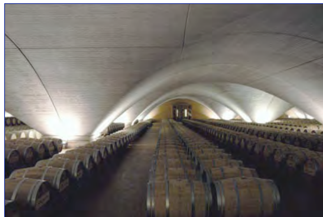
Otazu's "cathedral" of wine

Its most impressive space is its vast underground aging cellar, 3,600 square meters, housing two thousand oak barrels, a mix of American and French oak. The cellar is divided into nine bays and covered by elegant vaults, which the winery calls its "cathedral" of wine.