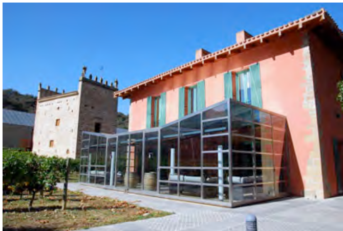
Tower and tasting room.

The award winning labels produced here are the outstanding Chivite Colección 125 and the Señorío de Arínzano, whose '01 vintage was selected as one of the 15 best wines of Spain. We sampled their Chivite Colección barrel fermented chardonnay '03, which has been awarded multiple prizes as Spain's top white wine. And we couldn't resist taking home a bottle of their late harvest Moscatel, Colección Vendimia Tardía, as utterly delicious and intense as it is rare.