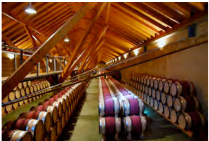
Rafael Moneo's stunning wine cellar in Bodegas Arínzano

In 1988 the family purchased the estate, commissioning Pritzker Prize winning architect, Rafael Moneo, a fellow Navarran, to design its state-of-the-art wine making facility. This soaring, cutting edge space, inaugurated by the King and Queen in 2002, is a knock-out! At Arínzano visitors tour the spectacular, enormous barrel aging room from above, via a 100 meter long catwalk, a bridge-like structure wedged between the sections of the roof framework. From this perspective the French oak Allier barrels appears to go for infinity!