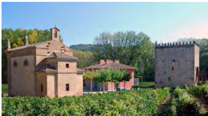
The Neoclassical chapel and 16th century tower