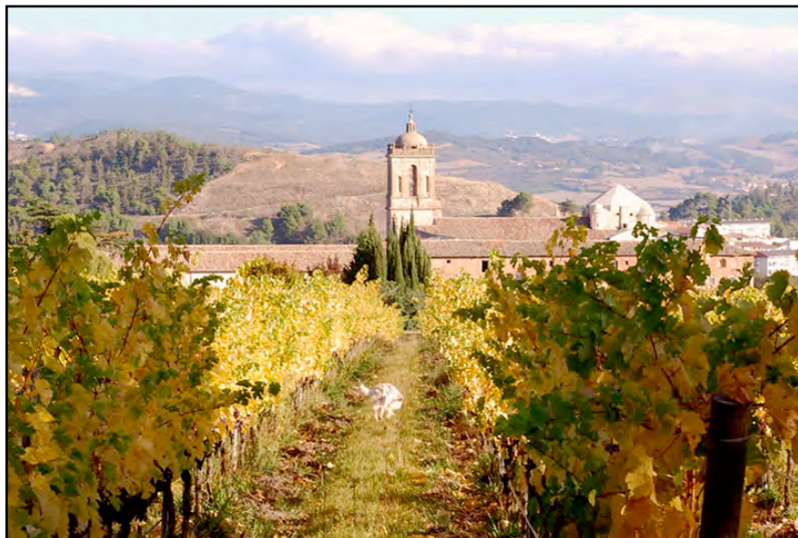
Fall colors at Bodegas Pago de Larrainzar, in Ayegui, south of Pamplona