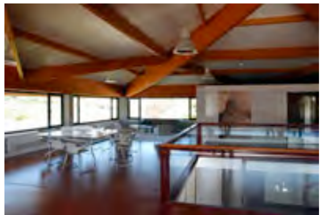
The tasting room of Pago de Larrainzar