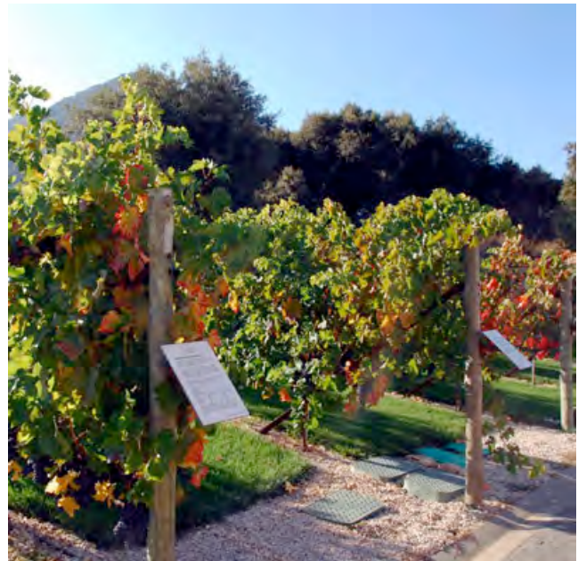
Part of the "trellis museum"

The private tour, for a small group of VIP clients, will include a four-course gourmet lunch, featuring local Navarran grilled vegetables and a very special roast suckling lamb prepared by the winery's acclaimed chef.