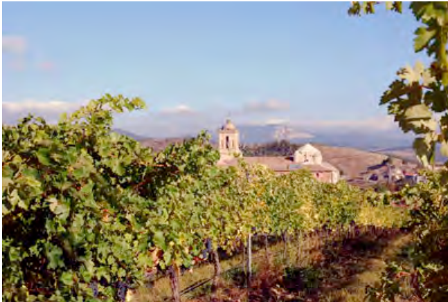
View of the Irache Monastery to the north

Our next stop was the Bodegas Pago de Larrainzar , just a short drive away in the village of Ayegui, also in the Tierras de Estella sub zone. This new and dynamic family-owned winery has been producing a single label wine since 2004, although the estate has belonged to the Larrainzar-Canalejo family for 150 years.