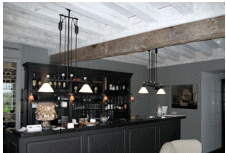
The adjoining bar is a relaxing spot to have a digestive following lunch or dinner.

The uniquely designed glass wall of the restaurant slides open, disappearing into the wall itself, offering a spectacular view of the Pays Basque countryside looking west toward the coast, St. Jean-de-Luz and La Rhune mountain.