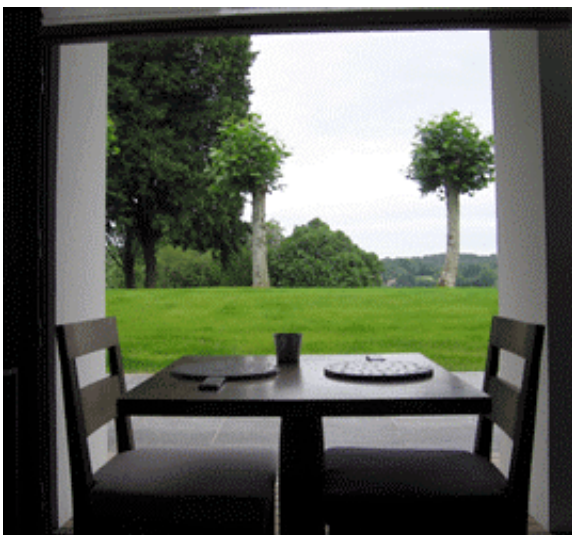
A view of the Pays Basque countryside from the restaurant.