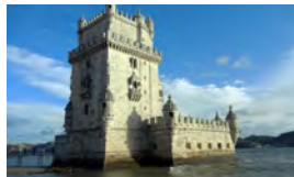
DISCOVER PORTUGAL LISBON TO PORTO