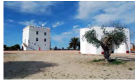
WINE TOURING IN THE ALENTEJO