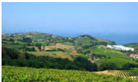
NAVARRA AND THE BASQUE COAST

Temperatures in the Alto Douro are finally cooling down with the approach of the harvest season. Here you can tour some of the magnificent Quintas and their terraced vineyards that line both sides of the the Alto Douro, where wine has been produced for more than 2000 years, join in a traditional grape harvest and savor the local cuisine.