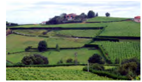
WINE TOURING IN THE PAIS VASCO