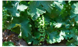
WINE TOURING IN CATALUNYA